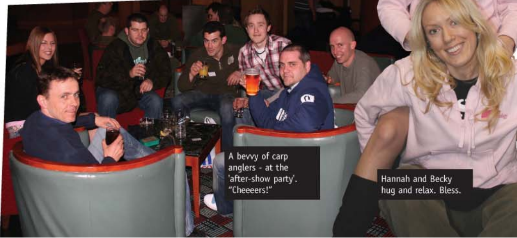
A bevvy of carp anglers - at the 'after-show party'. "Cheeeers!"