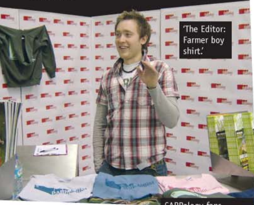
'The Editor: Farmer boy shirt.'