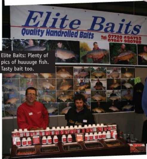
Elite Baits: Plenty of pics of huuuuge fish. Tasty bait too.